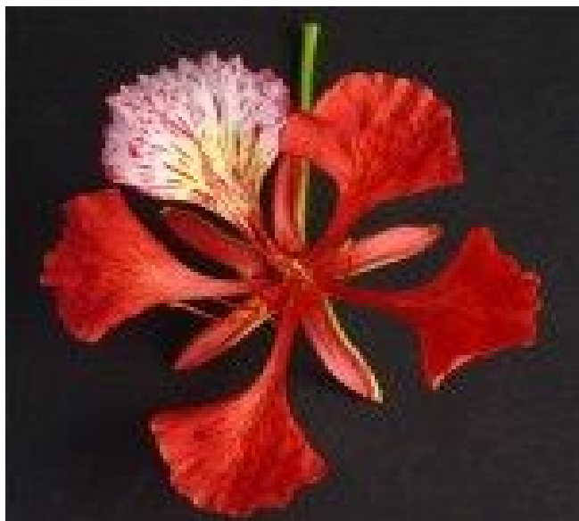
Fig 1: Photograph of Delonix regia flower

Hence the present study an attempt is made to quantitative estimation of total phenolic and flavonoidal content from flowers of this plant.