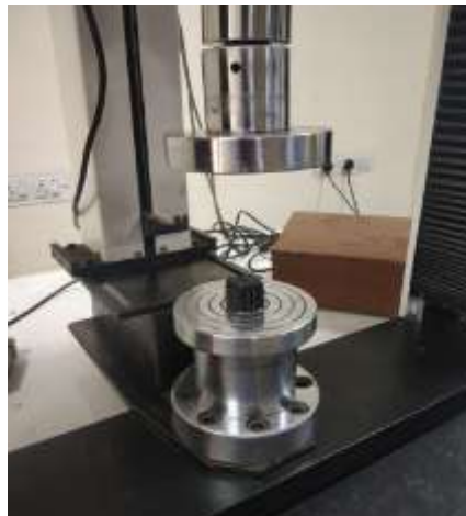
Fig 4 Universal Testing Machine