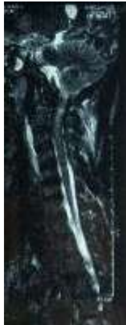
Fig 3. MRI of the cervical spine shown cord oedema on C2-C3

Patient was treated with skull traction using gardner well tongs traction, 4 kg was used as initial traction weight and patient shown a gradual improvement of his motoric and sensoric function. We continue the traction for 7 days and while maintaining skull traction, we performed atlantoaxial fusion with lateral mass fixation and put allograft (Demineralized bone matrix). We also performed ORIF on his left clavicle. Improvement of motoric function was recorded with ASIA grade D, 1 month after the surgery. Improvement of motoric muscle power was recorded with upper motor (4/5) and normal muscle power on both leg (5/5). Sensoric function was seen improved but still felt a bit of numbness on his right arm.