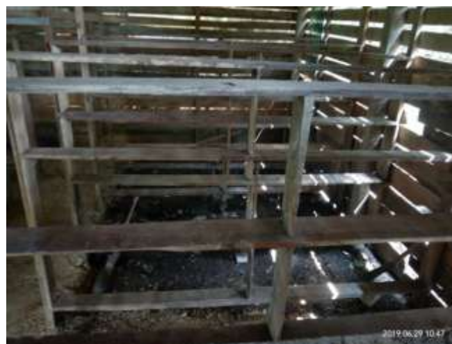
Picture. 1. Making Baglog Shelves