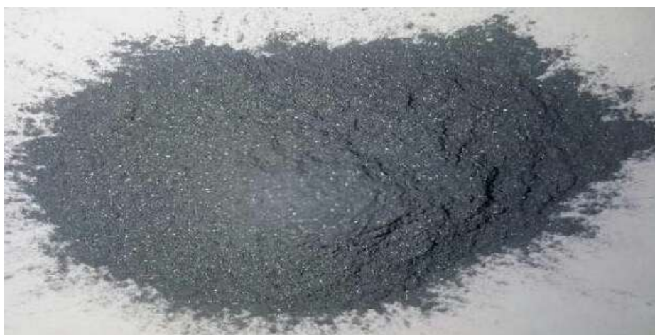
Fig:2 Silicon Carbide