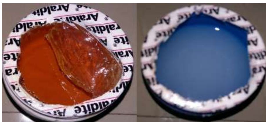
Fig: 3 Hardener and Resin