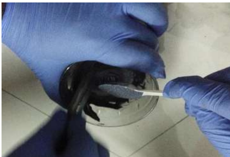
Fig: 5 Formation of Epoxy Matrix

The epoxy resin is provided with two parts a Resin and a Hardener. Resin and the hardener are mixed in the ratio 1:1 volumes till pale color liquid is obtained. Then Sic is added 80% of weight. It is added little by little and constantly stirred. Finally a slurry is formed from Sic and Epoxy.