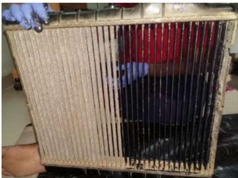
Fig: 6 Coating

Coating is a covering that is applied to the surface of an object, usually referred to as substrate. The method employed here is film coating. Film coating is a thin polymer based coat applied to a solid. Then the formed slurry of SiC and Epoxy was coated over the entire surface of the tube by means of a small shovel and thickness was measured and then lapsing part was once again coated. Excess was scraped off.