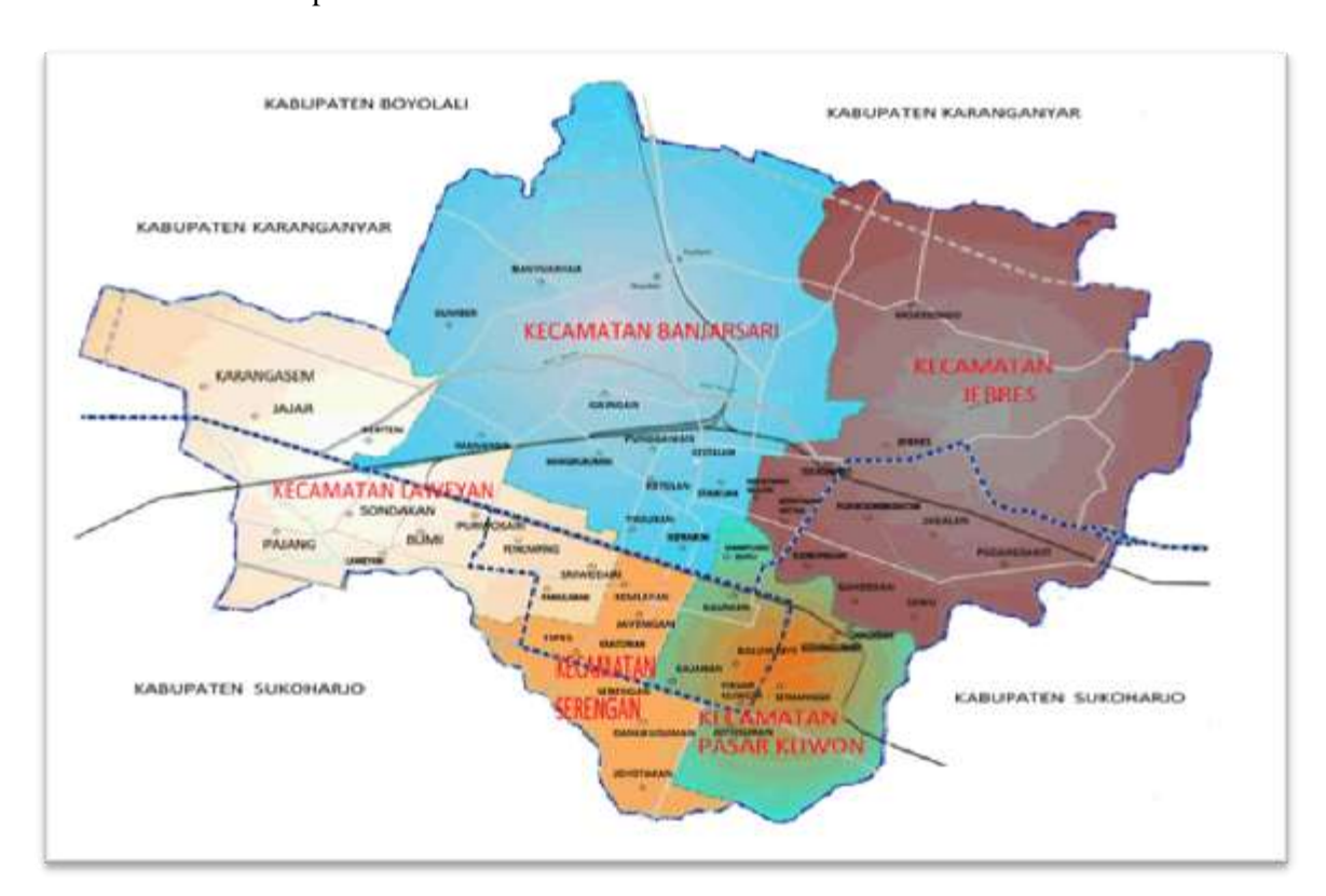
Fig. 2: Map of Surakarta

This research was specialized for districts that used the service from PDAM of Surakarta, i.e. Laweyan District (Bumi, Jajar, Karang Asem, Laweyan, Kerten, Pajang, Purwosari, and Sondakan). Laweyan District was selected as the research location because it is the consumer of Perumda Packaged Water by Surakarta City whose water source is mainly from Cokro Tulung water spring. The production source at southern regions of Surakarta (Laweyan District) with the total production of 243.19 liter/sec consists of deep well in Karangasem with water debit of 6.19 liter/sec and Cokro Tulung water spring with the debit of 237.00 liter/sec. Surakarta map is shown below: