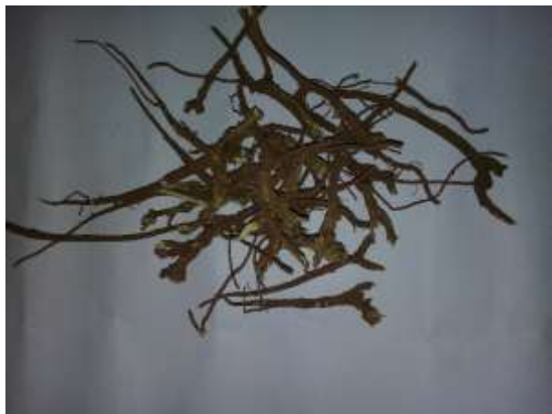
Figure 1. Medicago sativa root

converting enzyme inhibition at 0.33 mg/ml. 15 The literature survey revealed that root of Medicago sativa have not been evaluated for Angiotensin converting enzyme inhibition activity so far. The purpose of this study was to estimate ACE inhibition activity by using an in vitro direct spectrophotometric assay. The assay method is based on the hydrolysis of the substrate HHL (hippuryl-L-histidyl-L-leucine) by ACE, and measuring the amount released HA (Hippuric acid) by specific colorimetric reaction of HA with Benzenesulfonyl chloride (BSC) in the presence of Quinoline.