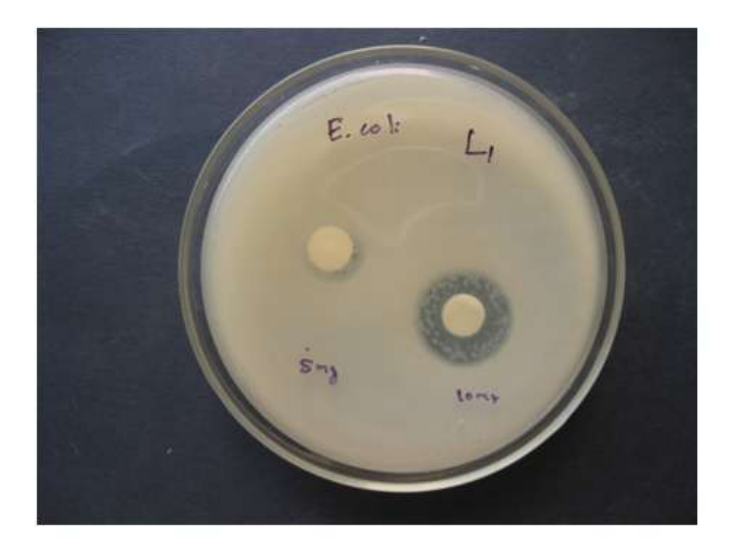
Fig.3. The zone of inhibition of the samples against (a) S.aureus bacteria (b) E.coli bacteria