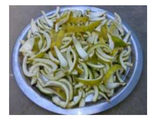
Fig S1. A. Leaves, fruits and seeds of Citrus macroptera. Fig. S1 B. Rind of Citrus macroptera