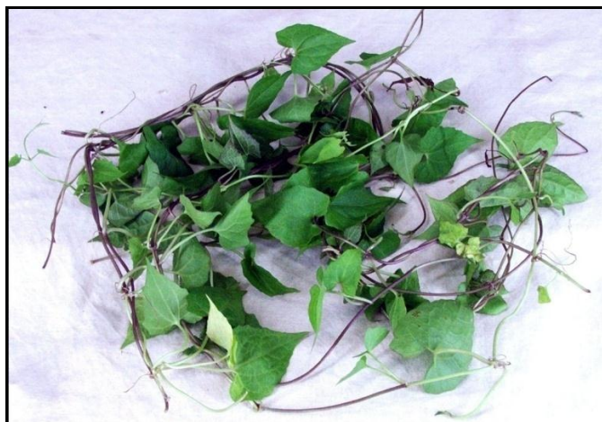
Mikania scandens (Aerial parts)