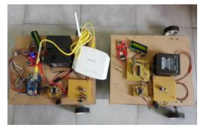
Figure 2 Hardware Setup for Transmitter Vehicle and Receiver Vehicle