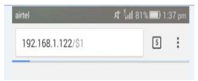
Figure 4 Distance Value