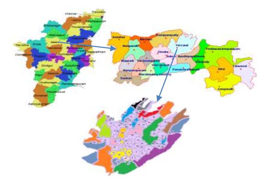
Figure 1: Study area map

Yercaud is a hill station situated in Salem District, Tamil Nadu. It is located in the Shervaroys range of hills in the Eastern Ghats. The total extent of Yercaud Taluk is 382.67 km2, including reserve forest. It is situated at an altitude of 1515 meters (4970 ft) above the sea level. The yercaud range consists of a chaean plutonic rocks of charnockite series and these have weathered into the rugged masses of hills. It is so named owing to a lot of trees categorized as a forest near the lake, the name signifying lake forest. A popular tourist destination, Yercaud is also called Jewel of the South. The climate of Yercaud is moderate and pleasant. There is neither a sharp winter nor a roasting summer. Winters are fairly mild, starting in September and ending in December. During winter, the hills are covered in mist. Winters range from 12 °C to 25 °C and summers from 16 °C to 30 °C. Rainfall is 1500–2000 mm.