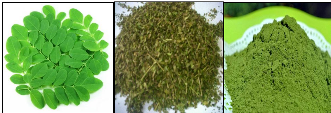
Figure 1. a. Fresh Moringa leaves; b. Moringa Leaf Simplicia; c. Moringa leaf powder Simplicia

Screening results simplicia Moringa leaf powder showed positive results against the class of chemical compounds alkaloids, glycosides, anthraquinone glycosides, flavonoids, steroid, tannins and saponins. Results of phytochemical screening simplicia powder can be seen in Table 1 below.