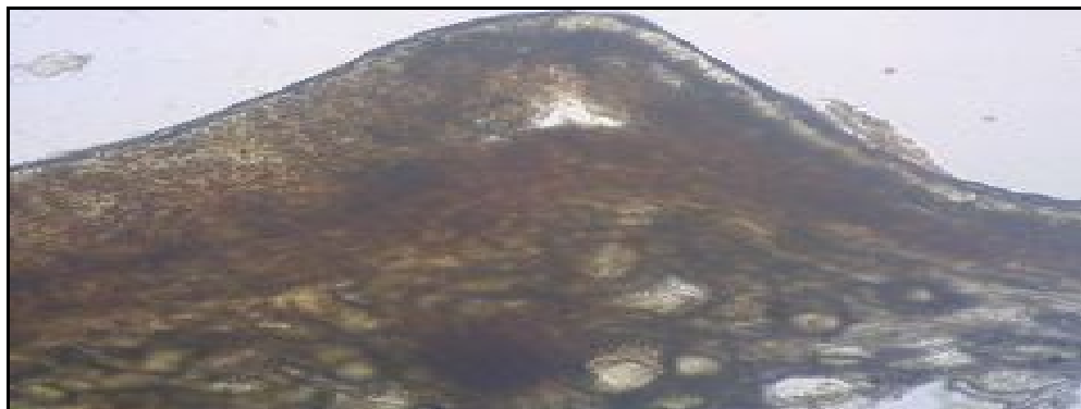
Figure 1: Transverse section of Carissa carandas fruit

walled tangentially elongated cells were seen in endocarp. Transverse section and powder microscopy of dried fruit 13 is showed in Figure 1 and 2 (A, B, C, D)