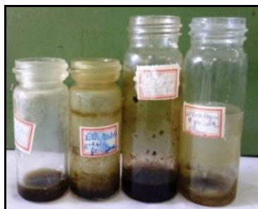
Figure 3: Successive extraction of the sample with various solvent systems