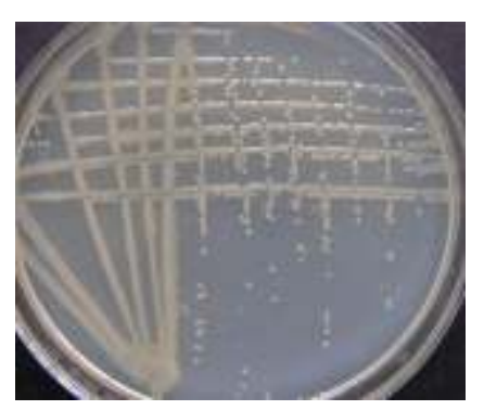
Fig 1: Endophytic bacteria isolated from Phyllanthus niruri leaves

Interaction between epbiotic bacteria and their host are knows to play a important role in environmental ecosystem but this association has received little attention. Presence of antagonistic bacteria on the surface of the soft coral and some medicinal plants have reported that control the some potent pathogens and observed than prominent activity<sup>[21,23,24]</sup>. Present finding suggests that significant epibiotic bacterial strain was isolated and active compound has been characterized.