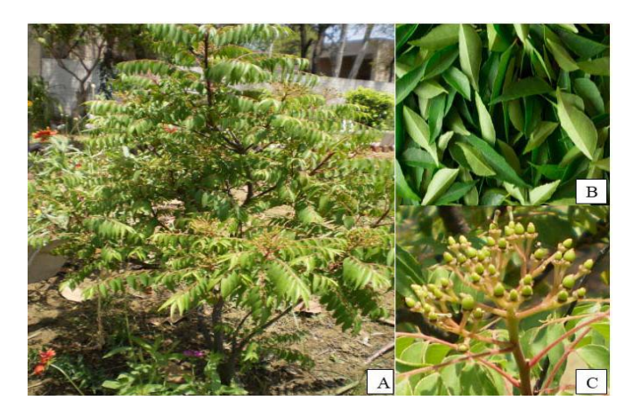
Figure 1: Shows the whole plant of Murraya koenigii (A) leaves (B), Seeds (C)<sup>4</sup>.

Family- Rutaceae Genus- Murraya J. Koenig ex L. Species- Murraya koenigii (L.)Spreng.