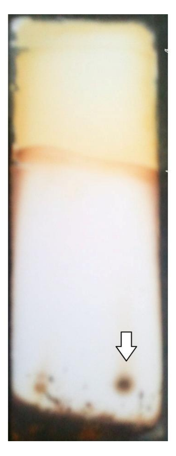
Fig.1 TLC plate containing spot of sobatum