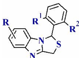
Figure 1. : 1-Aryl-1 H , 3 H -thiazolo[3,4- a ]benzimidazole (TBZ) analogues

The modeling studies carried out on 1 H , 3 H -thiazolo[3,4- a ]benzimidazole (TBZ) analogues (Figure 1) [10], a class of NNRTIs, highlighted the importance of 2,6-dihalo substitution on the phenyl ring at C1 of the nucleus for the activity and also their ability to take "butterfly-like" shape on binding to the receptor site [11]. In this background TBZ analogues were modified by opening imidazole ring of TBZ (Figure 1) to generate 2,3-diaryl-1,3-thiazolidin-4-ones [12] as a new NNRTI scaffold to inhibit HIV-1 RT.