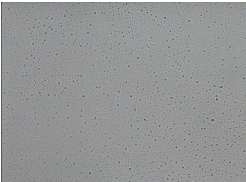
Fig. 1. Photomicrograph of liposomes (formulation D)