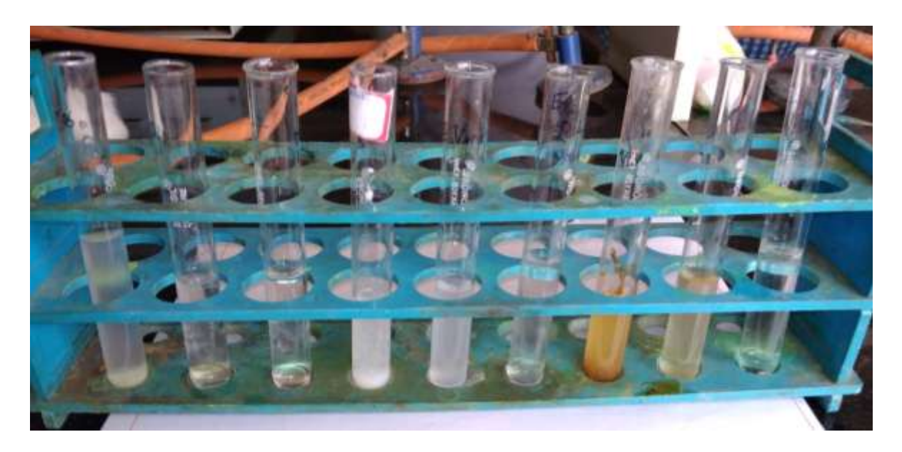
Figure: 1 serial dilution