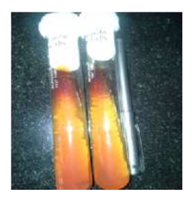
Fig-4: Test tube having mannitol red agar showing positive result

Phenol-Red Mannitol Broth is used for this test. It is a nutrient broth to which 0.5-1% mannitol is added and the pH indicator used here is Phenol-Red which is red at neutral pH and turns to yellow on change of pH<6.8. It would also change to pink on increase in from neutral pH. An overnight incubated culture is streaked on the medium. An isolated single colony was picked from HiCrome Bacillus Agar plates and suspended in medium. Suspension was streaked on tubes and incubated overnight at 35-37°C. Later, results were checked for color change from red to yellow, would indicate positive result. The medium contains peptic digest of animal tissues and meat extract, which provide nitrogenous compounds. Mannitol serves as the fermentable carbohydrate, fermentation of which can be detected by phenol red. Mannitol fermenting organisms like B. megaterium yield yellow coloured colonies as shown in Figure 4.