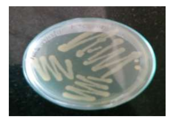
Fig-1: Bacillus megaterium streaked on agar plate