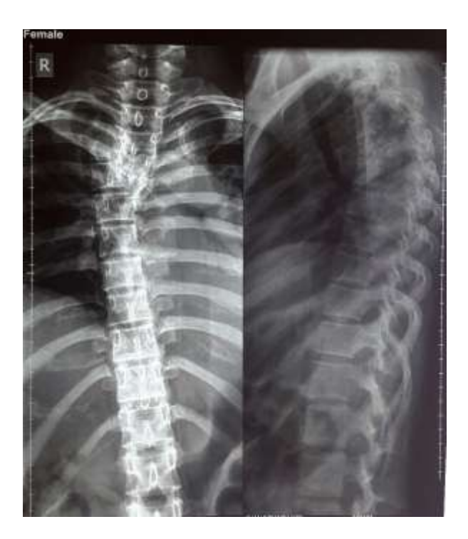
Figure.1 AP and Lateral radiographs of the thoracic spine revealed fracture and anterolateral dislocation of the T4 and T5 vertebrae

A patient with thoracic spinal fracture-dislocation without neurological symptoms should be evaluated in detail, especially with three-dimensional reconstruction by computed tomography.