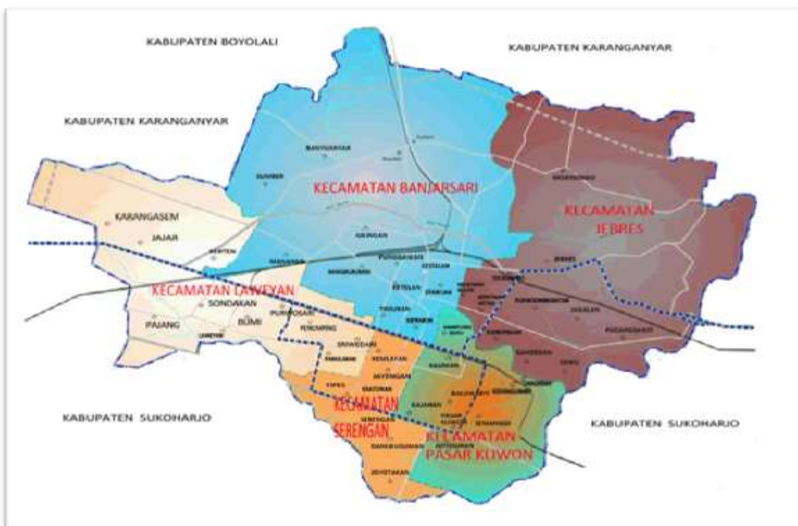
Fig. 2: Map of Surakarta

This research was specialized for districts that used the service from PDAM of Surakarta, i.e. Laweyan District (Bumi, Jajar, Karang Asem, Laweyan, Kerten, Pajang, Purwosari, and Sondakan). Laweyan District was selected as the research location because it is the consumer of Perumda Packaged Water by Surakarta City whose water source is mainly from Cokro Tulung water spring. The production source at southern regions of Surakarta (Laweyan District) with the total production of 243.19 liter/sec consists of deep well in Karangasem with water debit of 6.19 liter/sec and Cokro Tulung water spring with the debit of 237.00 liter/sec. Surakarta map is shown below: