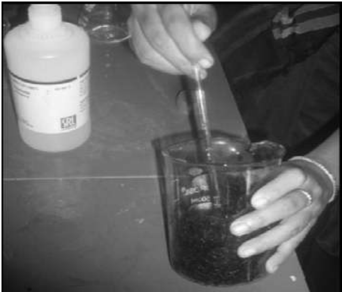
Picture of Cleaning Hair using Acetone