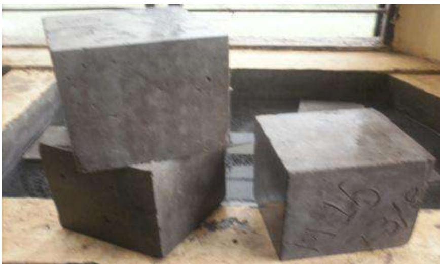
Picture of Cube specimen