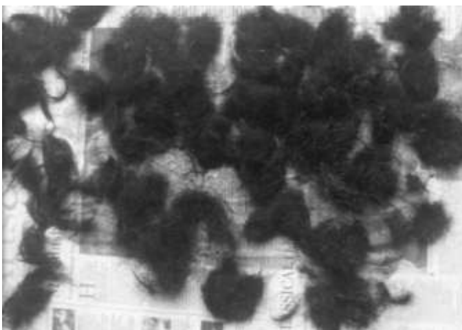
Picture of Image of Human hair