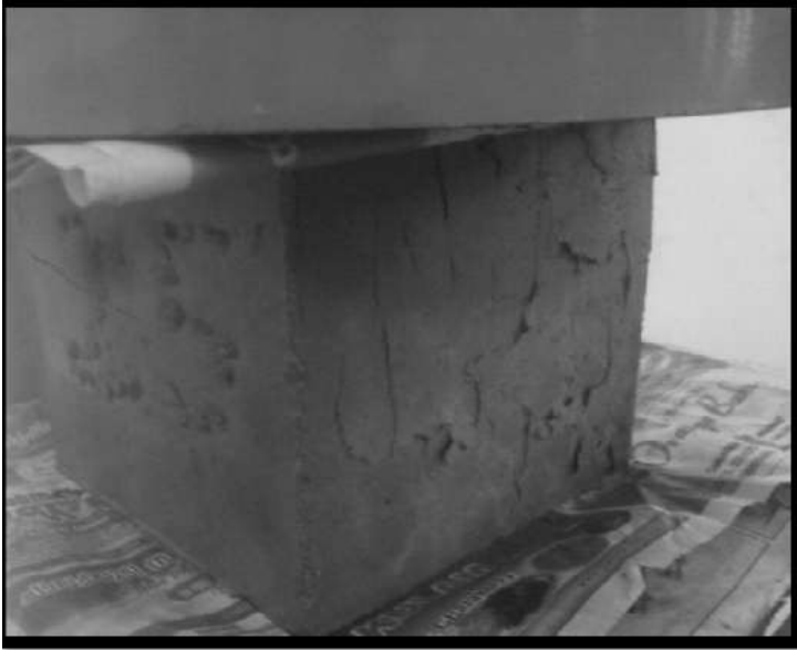
Picture of Compressive testing machine