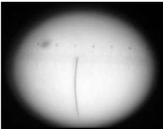
Picture of Microscopic image of hair