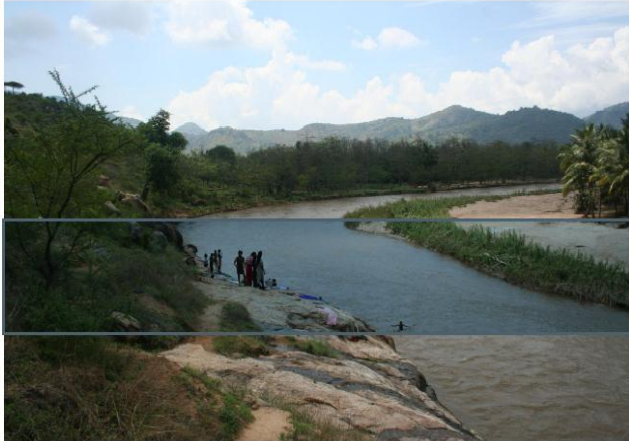
Fig2. Rock Formation and Sand Deposition on U/S of Vaigai River