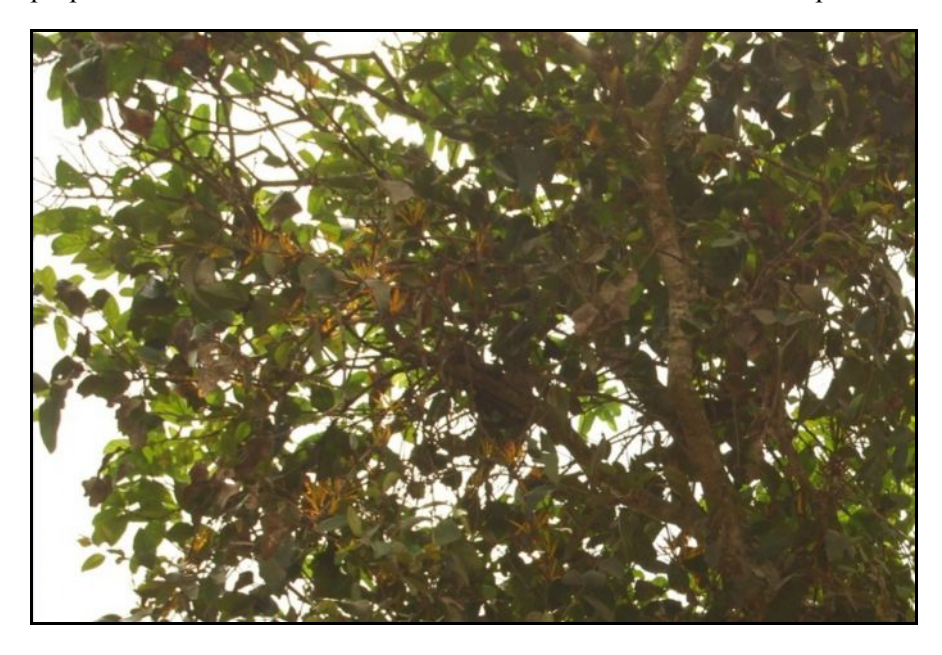
Leave and Seed of Kola acuminata

antibiotics, led scientific community to find new antibacterial compounds from medicinal plants or to prepare synthetic and semi-synthetic antibacterial drug products with low toxicity<sup>11</sup>. Several medicinal plant extracts, plant products and isolated phytochemical constituents showed highly significant antimicrobial activity which added more to encourage research on such potential natural products/drugs<sup>12</sup>. Loranthus micranthus Linn is the Eastern Nigeria species of the Africa mistletoe which has been used widely in ethnomedicines as anticidiabetics<sup>13, 14</sup>, anticancer, antihypertensive, antimicrobial e.t.c. Different research teams have worked on various species of the plant and demonstrated some pharmacological activities, which supported the ethnomedicinal uses<sup>15</sup>. This research aims at extracting and evaluating the antimicrobial and phytochemical properties of the methanolic extract of Loranthus micranthus Linn parasitic on Kola acuminate