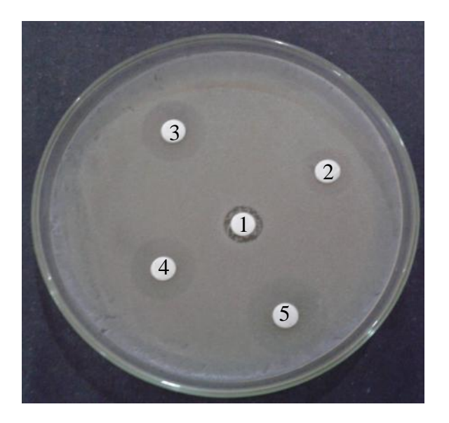
Fig. 3 Antimicrobial susceptibility of pyocyanin pigment toward E. coli by Disc diffusion method 1 – control; 2 – 5 ug/ml; 3 – 10 ug/ml; 4 – 15ug/ml; 5 – 20ug/ml