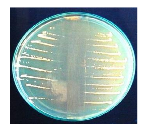
Fig. 4 Antimicrobial activity of pyocyanin pigment by Cross streak method toward P. vulgaris